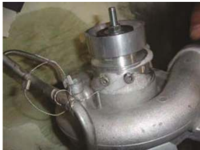
WRONG RESTRICTOR SEALING